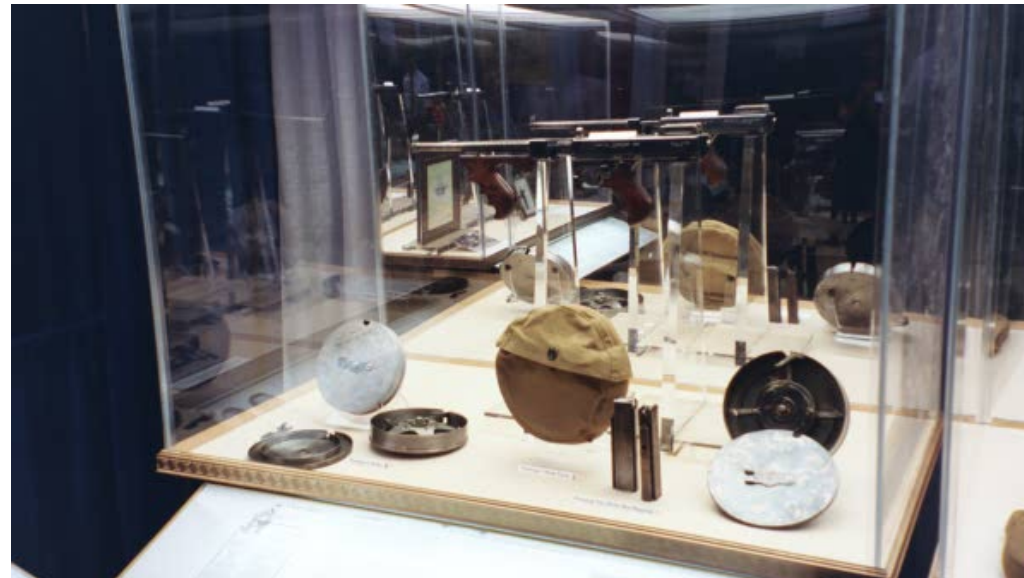
Another early Model 1919 (SN: 11) and prototype magazines