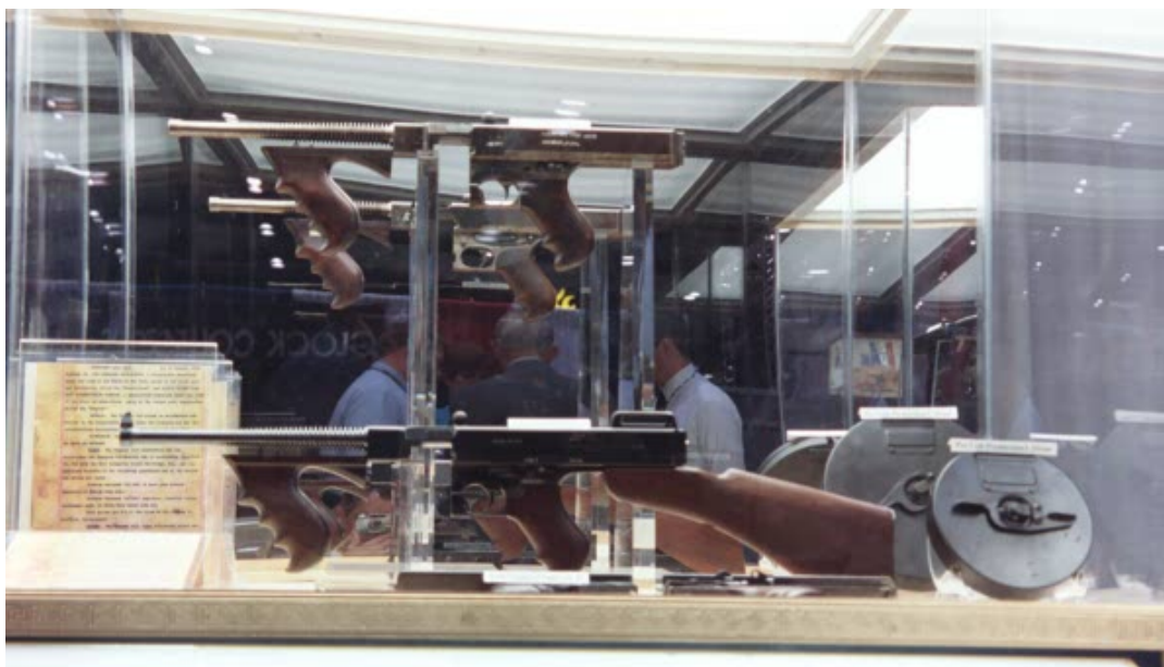
Two more Model 1919s, early 100 and 50 round drums