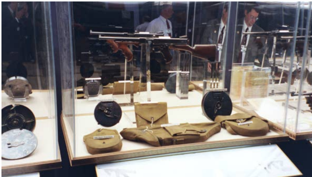
Model 1919 (SN: 17) and the “Salesman’s Kit”