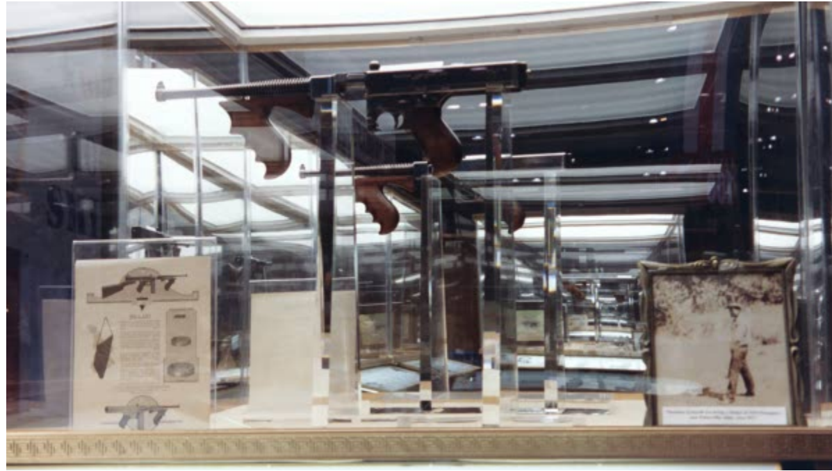
Model 1919 serial number NO and early advertisements